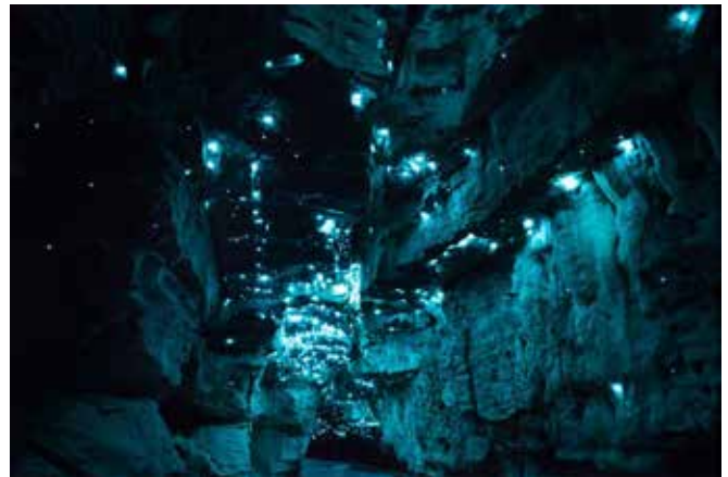
(Series Luminosity, New Zealand, North Island, 2015. Long-exposure photography. More of this work can be seen in Colossal, Wired, The Verge, and Juxtapoz).