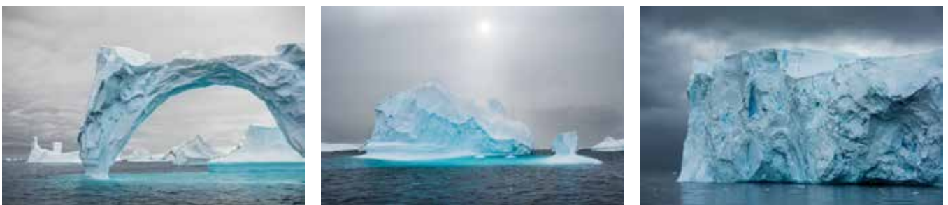
(Series Iceberg, Antarctica, 2015. Michael used a night-time lighting technique with long exposure to capture the details and textures of Antarctic icebergs, illuminating ice formations with LED lights, which allowed him to highlight the complexity and beauty of their surfaces at night. This technique creates a dramatic and sculptural effect, emphasizing the unique tones and textures of the ice, which in the photographs appears almost otherworldly).

( https://www.joemichael.co.nz/#/united-nations )