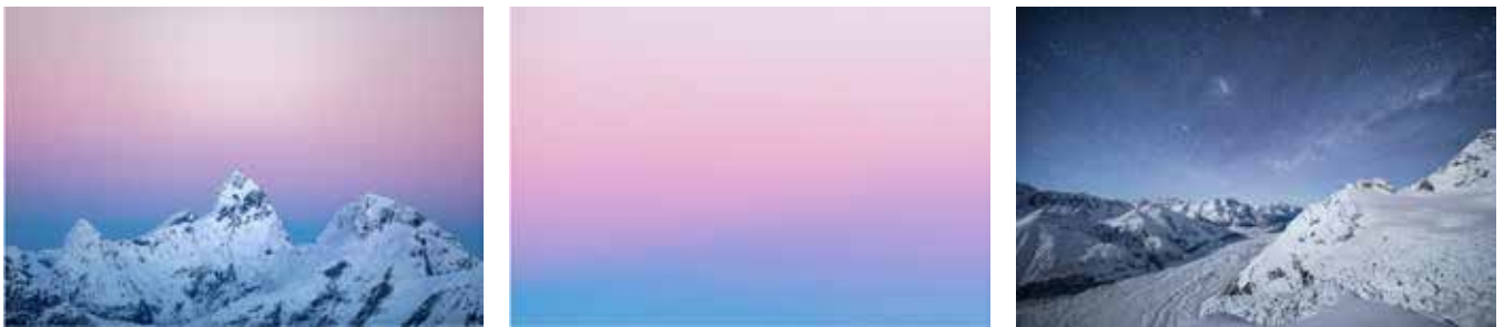
(Series The Hour of Change, New Zealand, 2017. Using a technique that combines photography with digital collage).

It is in this context that we find the work of Joseph Michael (New Zealand, 1985), a visual artist and photographer whose work challenges the boundaries between art and nature. Through long-exposure photography, Michael reflects on the relationship between humans and their natural surroundings. His work not only captures the beauty of landscapes and urban environments but also represents the interdependence and fragility of global ecosystems, emphasizing human responsibility for their preservation.